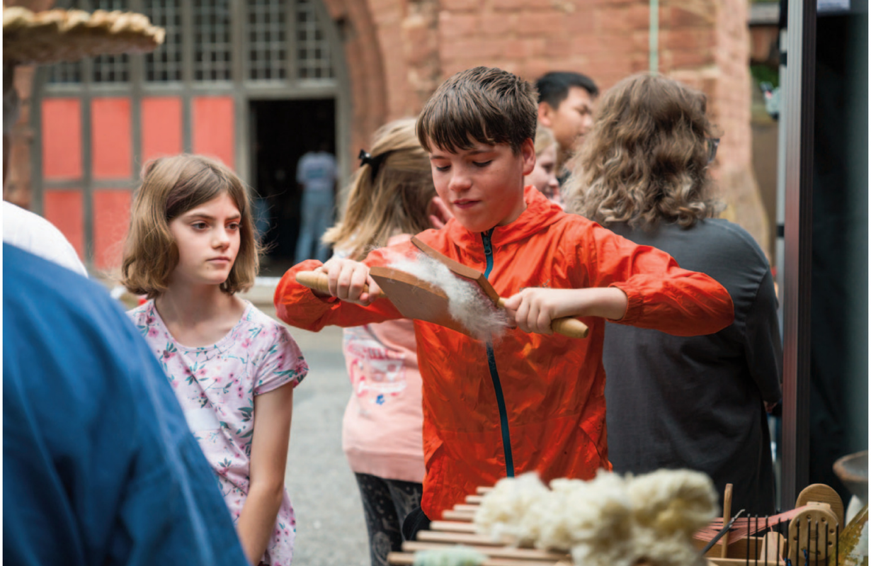
36 |British Archaeology|November December 2024