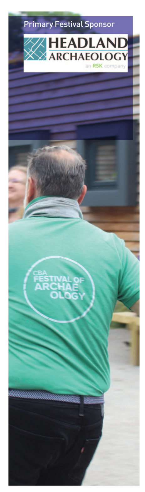
Right: More than 379 events and activities delivered across the UK by 271 organisers, with an incredible range of opportunities to explore archaeology, including skills days, talks, and guided walks, youth events, and bands on creative activities