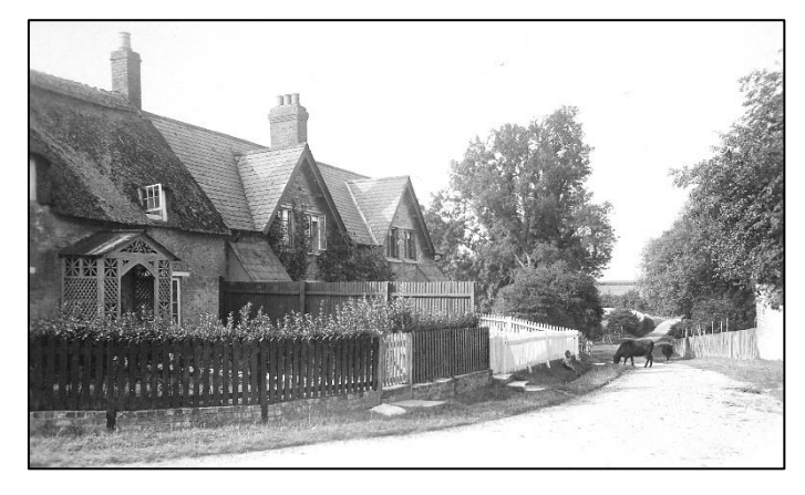
On the left, the late 1600s cottage at the south end of Church Lane, in 1910.

Continue to walk along Church Lane . [58] is the site of the former Sheepwash . This part of Church Lane was formerly known as Sheepdyke Lane .