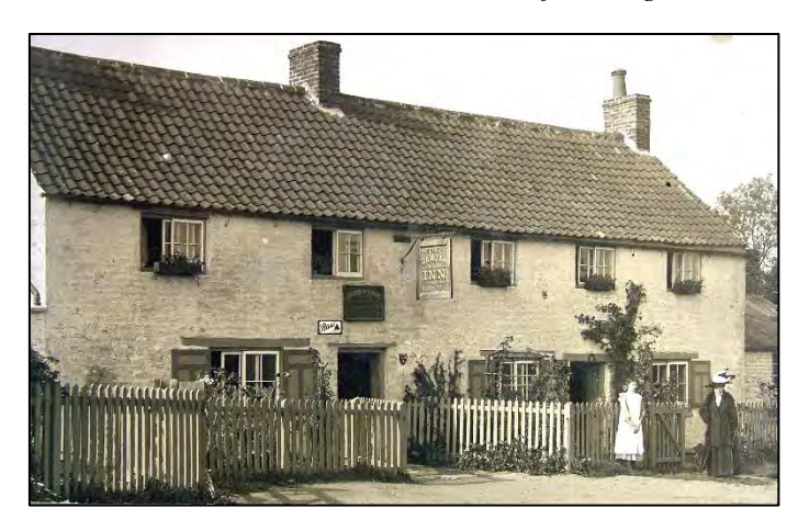
The Ram Jam Inn in 1913. It closed in 2013.

Greetham (derivation - village on gravel) in the past has been known as Gretham , Greteham , Greatham and Gretam . The village is at the extreme western end of the parish - the parish boundary with Cottesmore is within a few metres of the first house at that end of the village. The eastern boundary includes Greetham Inn and The Ram Jam Inn (formerly the Winchelsea Arms ), both on the Great North Road, and the former Woolfox Lodge airfield.