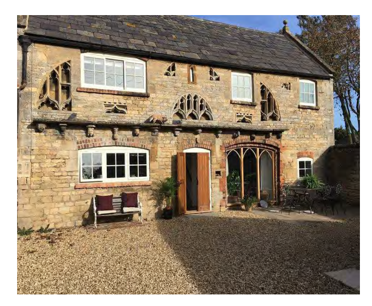
Halliday's workshop, now a holiday cottage. (RO)

Turn right into Pond Lane . [42] is thought to be the site of the village pond which was filled in some 80 years ago. Walk the short distance to the bridge over the stream. On