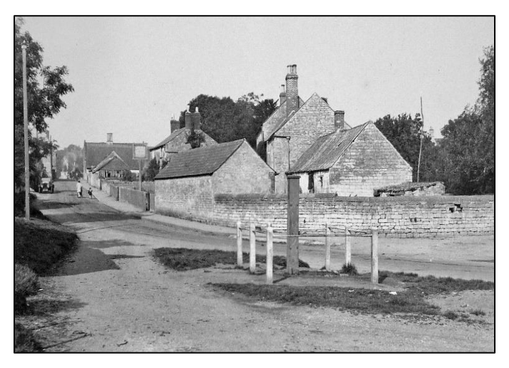
The village pump at the east end of Main Street in 1927.

[23] was a patch of grass often referred to as the Village Green . At one time there was a shed here and this is where