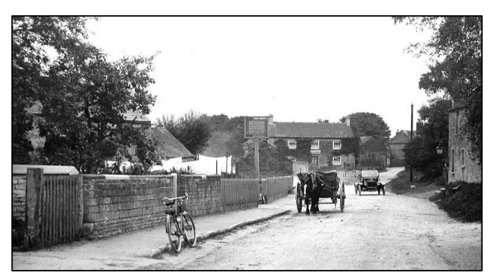
The east end of Main Street looking east in 1912. The Black Horse public house is on the left with The Wheatsheaf beyond.

Collyweston stone slate roof, used for storing farm wagons, probably in turn converted from former cottages.