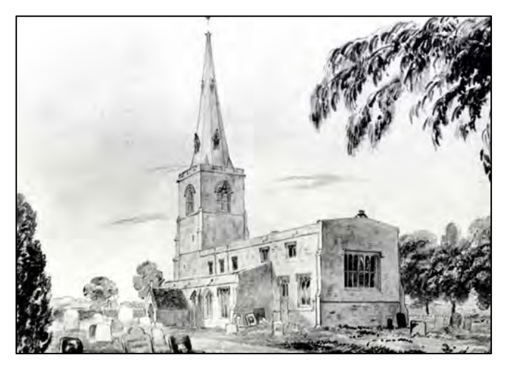
St Mary's Church in 1797 by John Feilding. (Rutland County Museum)

Opposite the church is the former grooms house and stabling [62] to Greetham House known as the Nags Stable .