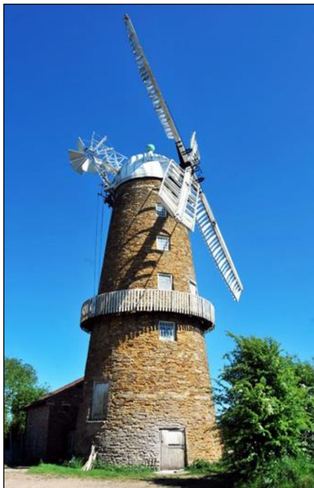
Whissendine Windmill.

To see Whissendine Windmill [18] , walk along Melton Road for a few hundred yards, and then turn left into the track leading to the windmill site.