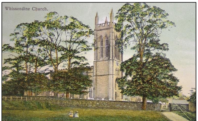
Whissendine Church c1915.

(Stamford Mercury 24th November 1876, page 1)