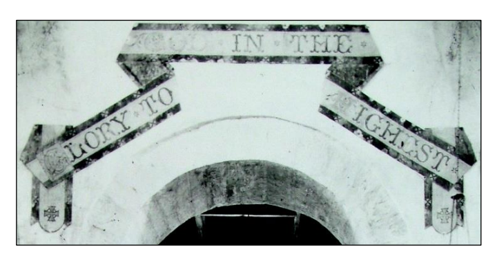
The scroll 'Glory to God in the Highest' now obliterated.

Between the font and the door is the stone coffin of a child. However, there is no evidence to date it. The rounded arch leading into the bell tower is Saxon in origin. Pevsner describes it as 'the only worthwhile piece of Anglo-Saxon architecture in the county'. Above it was a decorated scroll inscribed 'Glory to God in the Highest', sadly now painted over.