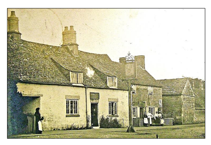
The Three Horseshoes and 'the bottom shop', c1905.

The carriage opening under the left-hand end of the former Three Horseshoes leads to Fountains Row [14],