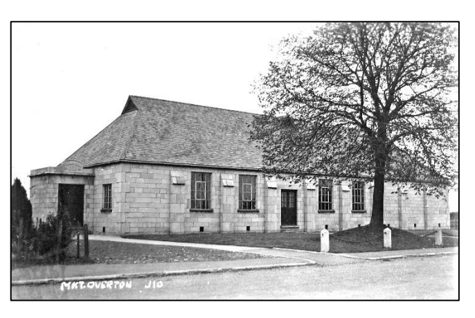
The newly erected Village Hall in 1932.

Turn left at the junction with Main Street to return to the Village Hall [1] and the end of this walk.