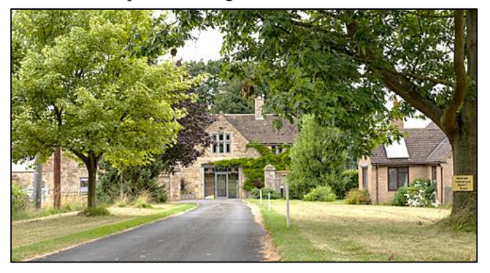
The Lodge Trust.

agriculturalist and Steward on the Estate. It was here that he started his prizewinning herd of Shorthorn cattle.