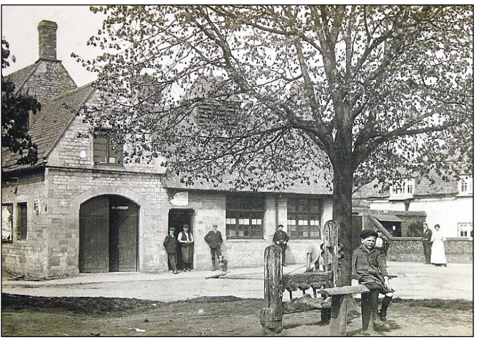
The smithy and stocks, early 1900s.

To the left of the entrance to Fountains Row, with its original door and weathervane in the shape of a fox, is the former blacksmith's workshop [15] which