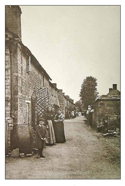
Fountains Row, early 1900s.

a row of small cottages originally built for the poor with outside taps and communal toilets.