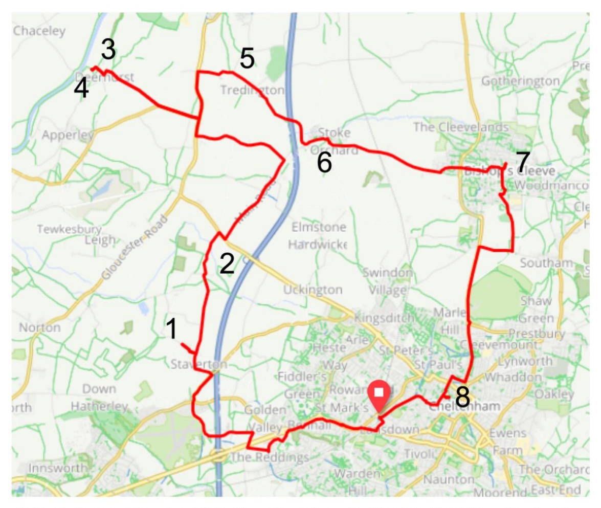
1) St. Catherine, Staverton; 2) St. Mary Magdalene, Boddington; 3) St. Mary Deerhurst; 4) Odda's Chapel; 5) St. John the Baptist, Tredington; 6) St. James the Great, Stoke Orchard; 7) St. Michael and All Angels, Bishops Cleeve; 8) Cheltenham Minster.