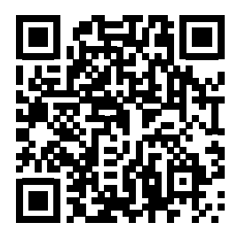
Scan me for Live Stream!

Attend in-person or follow along on YouTube