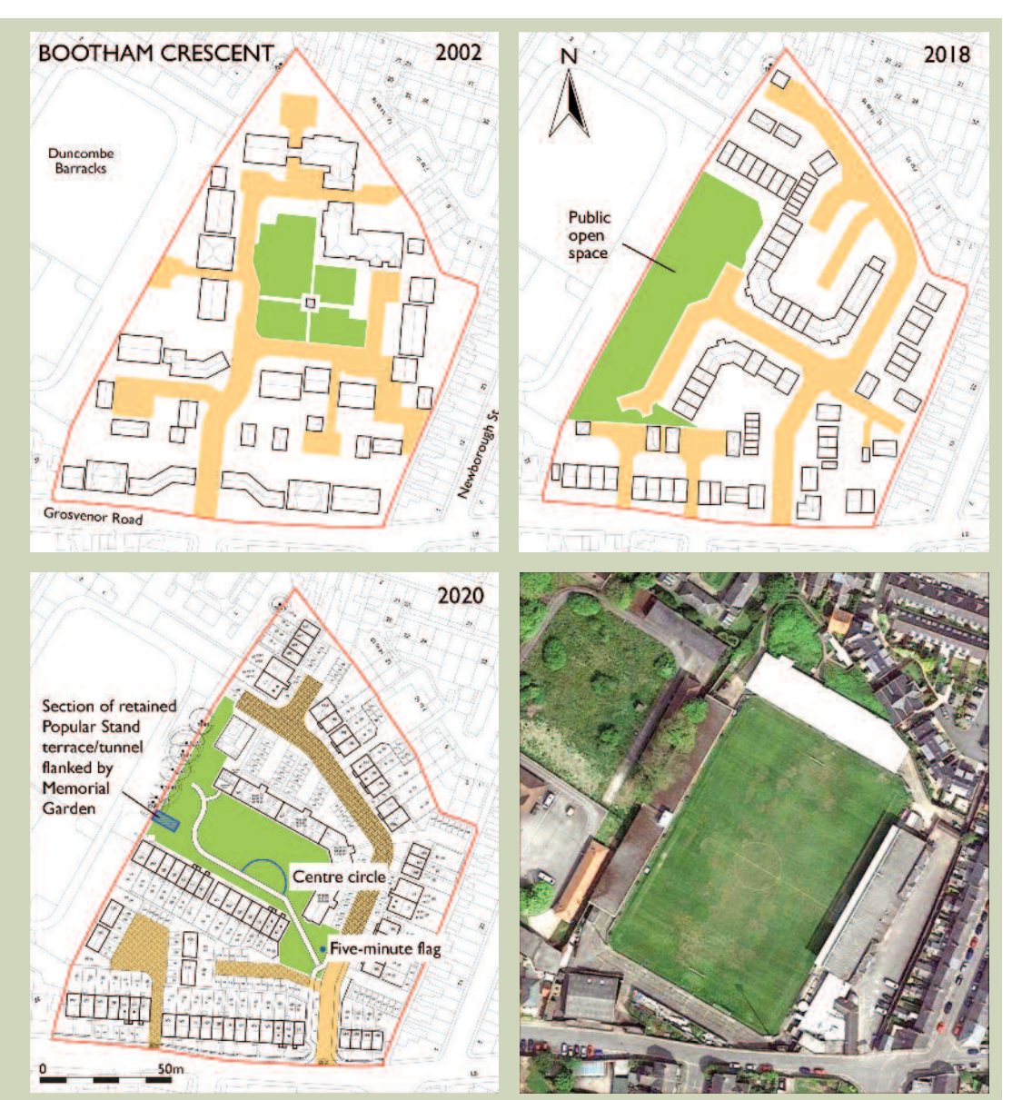
Above: Iterations of a bousing scheme. In the 2002 layout, the Public Open Space (POS) was roughly centred on the football pitch but the development's shape and orientation failed to respect the stadium's plan form. In the 2018 scheme (prior to Historic England's involvement), orientation was improved with the POS shifted to the west, probably anticipating plans to link up with a proposed redevelopment on the adjacent site. The final scheme, following consultation with Historic England, was the one that won planning approval in 2020. The concept was now to provide a central built form, with town houses and apartments framing a central POS with gaps between, giving the feel of a "stadium nestled between terraced housing". The POS contains the retained terrace/tunnel and adjacent Memorial Garden, centre circle and five-minute flag. In an earlier version it was suggested that the Memorial Garden occupy the centre circle but this was changed so as to provide a more discreet location for remembrance. A further recommendation by Historic England saw the central built form aligned to the west boundary wall to respect the stadium's orientation. The Club and Persimmon Homes bave submitted a request to the local authority to name the road, cycleway and apartment blocks after former York City players, including David Longhurst Way (the author would like to put in a cheeky bid for Club legend Arthur Bottom)

Right: A tunnel under the rear of the Popular Stand allowed rival fans to switch ends at half time