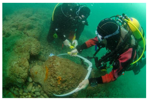
Divers measuring cannon on the Chesil Beach Protected Wreck