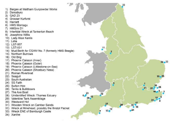
List of Scheduled Wreck Sites

This legislation relates to the scheduling of sites that are nationally important. In recent years, we have been applying this means of protection more widely to our maritime cultural heritage. This is because access to these sites is not as restrictive as wreck sites designated under the 1973 Act. They are still nationally important, but scheduling a wreck site allows recreational divers to dive it and takes into account the location, nature of the site and artefacts that might be present. Certain activities may require additional consents.