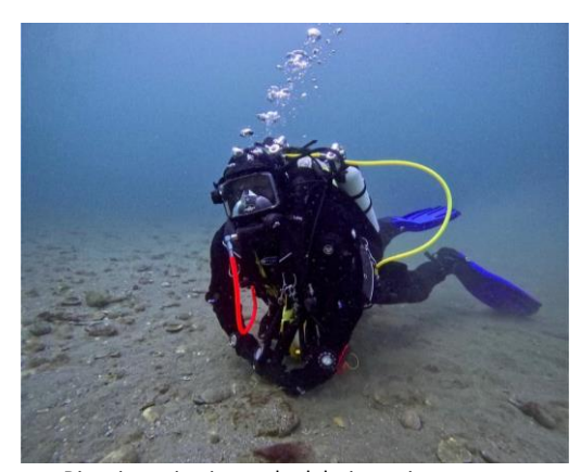
Diver investigating seabed during a site assessment